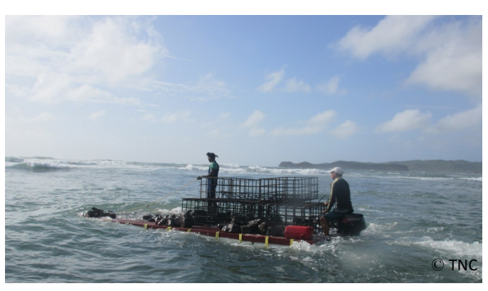
Custom made barge loaded with baskets and rocks for constructing breakwater.