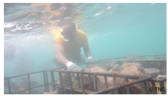
Divers carrying and packing the baskets with large armor rocks from the Telescope quarry