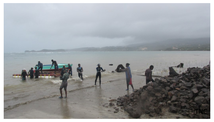
Loading the barge with rocks from the beach, done manually by a team of 10 spearfish divers from the Grenville community.