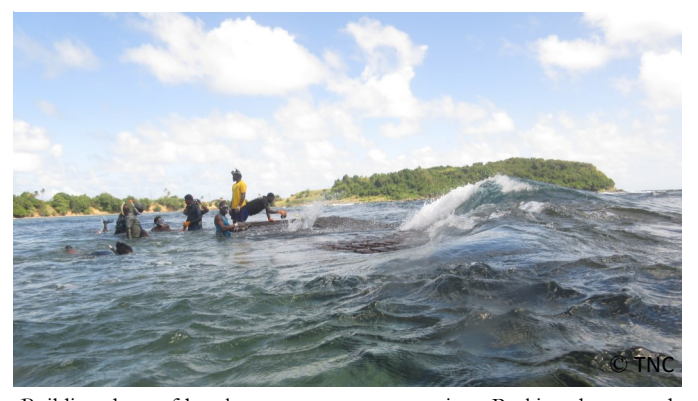
Building the reef breakwater, one stone at a time. Packing the second layer of baskets at low tide with waves now breaking directly on the breakwater.

Despite fairly rough January seas, construction of the pilot breakwater structures was completed as specified by the engineering designs on time with no major injuries or mishaps. While the feasibility of constructing the breakwater has now been established, a number of outstanding questions regarding the breakwater design and potential impacts remain to be answered over the coming months before a final assessment on its suitability for Grenville can be made.