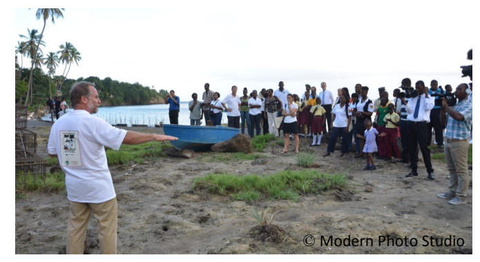
A cross section of launch attendees during an interpretative walk-through of the project site

With support from The German Federal Foreign Office and in partnership with Grenada Fund for Conservation, Grenada Red Cross Society and community members, the pilot project for building a submerged breakwater on the Grenville reefs was formally launched in early January 2015. A total of 30 meters of submerged breakwater structures were constructed on the northern portion of the Grenville reef flat.