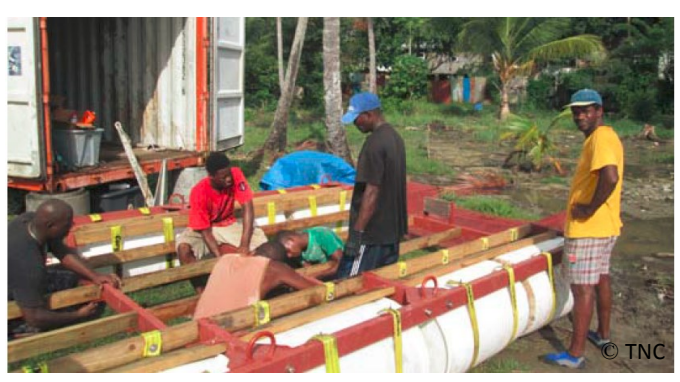
Assembly of the barge utilized to transport materials out to the reef. The barge was designed and built by Underwater Solutions with 50 gallon molasses barrels serving as pontoons