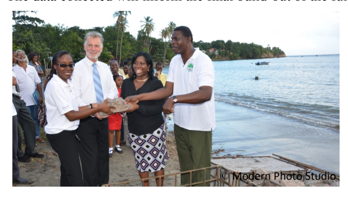
Official Rock Placing with the German Ambassador to the Caribbean (Dr. Goergens) and Parliamentary Representative Hon Emmalin Pierre. The pilot phase is funded by The German Federal Foreign Office

The resulting design incorporated a new type of thick steel gabion basket made out of 5/8" rebar, that could be filled with a variety of materials and stacked and locked together in a pyramid allowing for different widths and heights. To test the integrity and feasibility of this new breakwater design, a pilot project was proposed before designing and constructing the full breakwater. A series of four pilot structures were installed, and will be monitored for the next year. The data collected will inform the final build-out of the full breakwater.