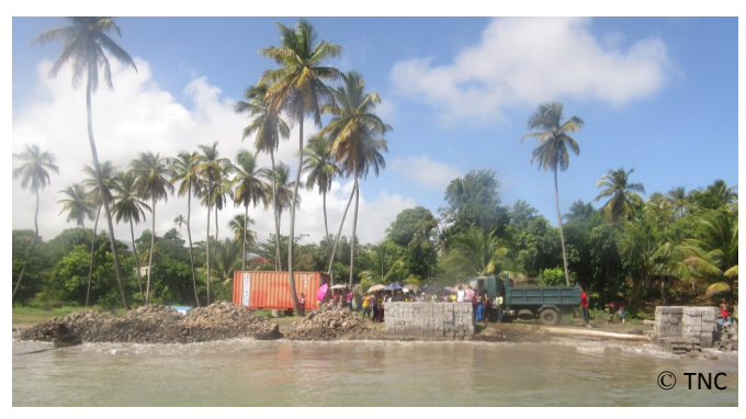
Telescope Beach - Grenada. The mobilization site for the Reef Engineering and Restoration Project where all materials and equipment were kept during construction. The site was landscaped on completion