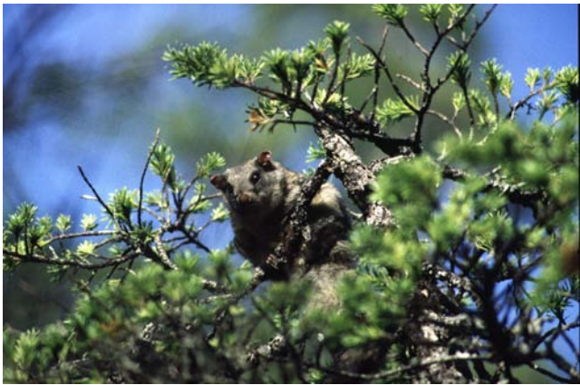
FIG 1. A northern flying squirrel finds refuge in the top of a shore pine ( Pinus contorta) near the edge of a muskeg bog on Prince of Wales Island. Old-growth forests are considered important habitat for flying squirrels throughout their range in North America.