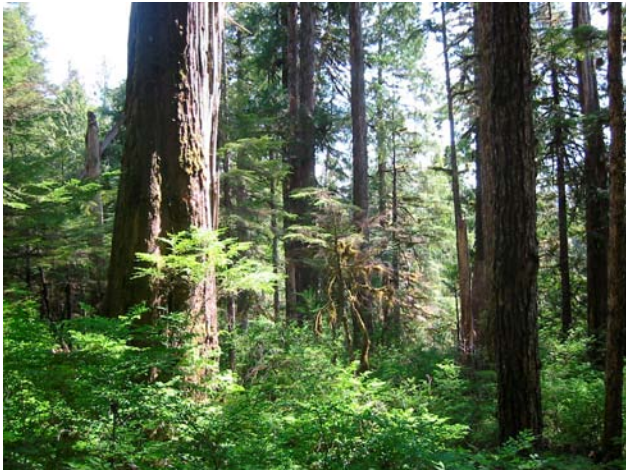
FIG 4. A productive old-growth hemlock spruce forest on Prince of Wales Island. Old-growth forests are uneven aged with multi-layered canopies and abundant plant communities on the forest floor. On well-drained soils such as those supporting this stand, old-growth forests support large-diameter trees and snags, which include cavities and structure used by flying squirrels for denning and resting. They are structurally complex and provide important habitat for flying squirrels. Western hemlock-Sitka spruce stands with large trees have high-density populations of flying squirrels.

densities were 56% higher in old growth hemlock-spruce (Smith and Nichols 2003, Smith et al. 2004). Flying squirrel densities increased with density of large trees (>29 in. [74 cm] diameter at breast height [dbh])