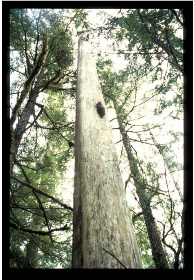
FIG 6. Flying squirrel climbing a snag on Prince of Wales Island. Large-diameter snags and old-growth trees provide important habitat for flying squirrels.

and snags (20–29 in. [51–74 cm] dbh). Cavities in trees and snags are used by flying squirrels in Southeast for denning habitat (Baker and Hastings 2002) (Fig 6). Other habitat variables that appear important to flying squirrels include cover of ericaceous shrubs (such as Vaccinium spp. ) and coarse woody debris (Smith et al. 2004). Although the features described above are typical in old-growth forests, no studies comparing flying squirrel density or habitat use in old growth and second growth have been conducted in Southeast.