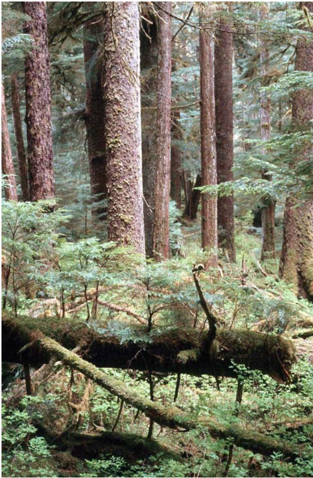
FIG 8. Old growth is structurally more complex than second growth, increasing habitat diversity. A nurse log in the foreground of the photo provides habitat and nutrients for young conifer seedling and saplings. The mycorrhizal fungi form a symbiotic relationship with roots of conifers and enhance their nutrient acquisition. Flying squirrels eat the fruiting bodies of these fungi, distributing the fungal spores throughout the forest, thus playing an important role in the ecosystem. (John Schoen)