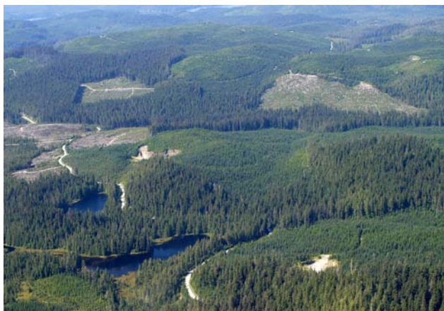
FIG 9. The Naukati watershed is located on northwest Prince of Wales Island. Note the patchwork of clearcuts, second growth, and old growth that occurs in this region of the island. Fragmentation of the natural forest mosaic has raised conservation concern for this endemic population of flying squirrels.

trees, and thinning) will likely be important for conserving this island endemic (Fig 9). Although Smith et al. (2005) indicated that flying squirrels were not an ideal management indicator species of old-growth forest structure, they suggested that the occurrence of widely distributed populations of flying squirrels may be a good indicator of landscape permeability and functional connectivity of the forest ecosystem. Clearly, additional research on the forest habitat relationships of flying squirrels in Southeast is needed to develop a comprehensive conservation strategy for populations of this important endemic arboreal rodent.