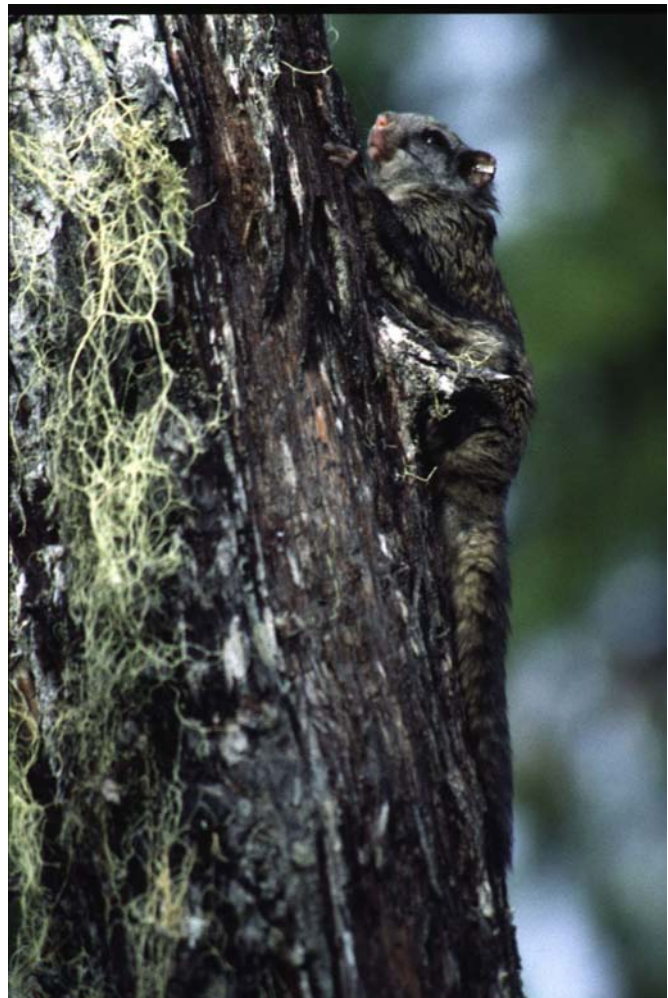
FIG 3. The Prince of Wales flying squirrel occurs throughout forested habitats on Prince of Wales and adjacent islands of the Alexander Archipelago. These southern islands are an important center of endemism for many small-mammal species, including this subspecies of flying squirrels. (Jeff Nichols)

Flying squirrels fill a distinctive ecological niche in Southeast and may play a key ecological role in nutrient cycling within the temperate rainforest by dispersing spores of mycorrhizal fungi, which are important vectors for nutrient transfer to conifer roots (Maser et al. 1978, Maser and Maser 1988, Mowrey 1994, Carey et al. 1999, Smith et al. 2005). Flying squirrels are also important prey for hawks, owls, and small carnivores (Mowrey 1994, Smith et al. 2005). Flying squirrels were a “design” species for small size old-growth reserves (<10,000 acres [4,050 hectares]) in the 1997 Tongass National Forest Land and Resource Management Plan (TLMP) (U.S. Forest Service [USFS] 1997a) because of their assumed “dependency on the forested habitats” (Suring et al. 1993). The subspecies G. s. griseifrons , endemic to the POW Island complex (Fig 3), has been listed as a subspecies of ecological concern in the Tongass National Forest (West 1993) and as potentially endangered in the