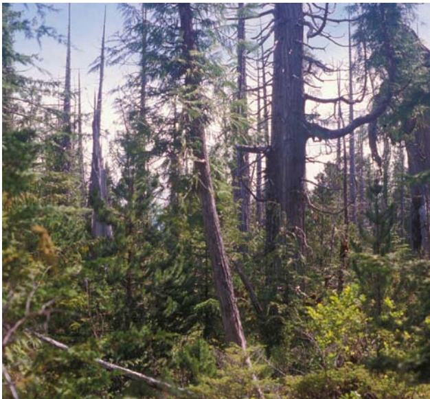
FIG 5. Scrub old growth on Prince of Wales Island. This stand of hemlock, cedar, and pine is situated on poorly drained soils near a muskeg bog. Trees in these forests are generally shorter and smaller in diameter than those on well-drained soils and have lower densities of flying squirrels.

and snags (20–29 in. [51–74 cm] dbh). Cavities in trees and snags are used by flying squirrels in Southeast for denning habitat (Baker and Hastings 2002) (Fig 6). Other habitat variables that appear important to flying squirrels include cover of ericaceous shrubs (such as Vaccinium spp. ) and coarse woody debris (Smith et al. 2004). Although the features described above are typical in old-growth forests, no studies comparing flying squirrel density or habitat use in old growth and second growth have been conducted in Southeast.