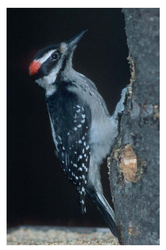
FIG 1. A male hairy woodpecker at a feeding site in southeastern Alaska. (Bob Armstrong)