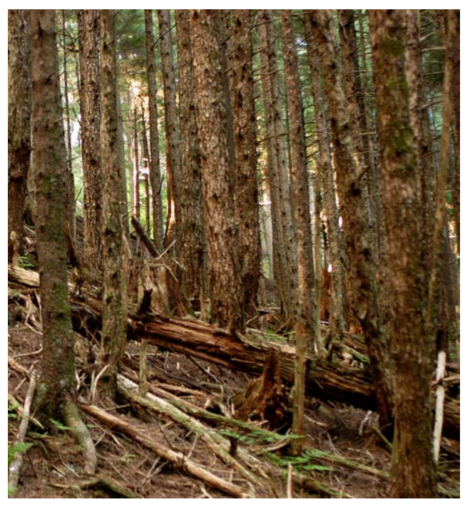
FIG 3. Second-growth forests have few snags and no large diameter trees and snags suitable for nesting habitat for hairy woodpeckers and other cavity nesting birds.

The inadequacy of monitoring protocols for land bird species in roadless areas of the Tongass National Forest, as in most of Alaska, has long been recognized. Boreal Partners In Flight, a cooperative effort between government agencies, and non-governmental organizations, has developed and is currently testing the Alaska Off-road Breeding Bird Survey (ORBBS). This project builds on the national BBS by focusing on