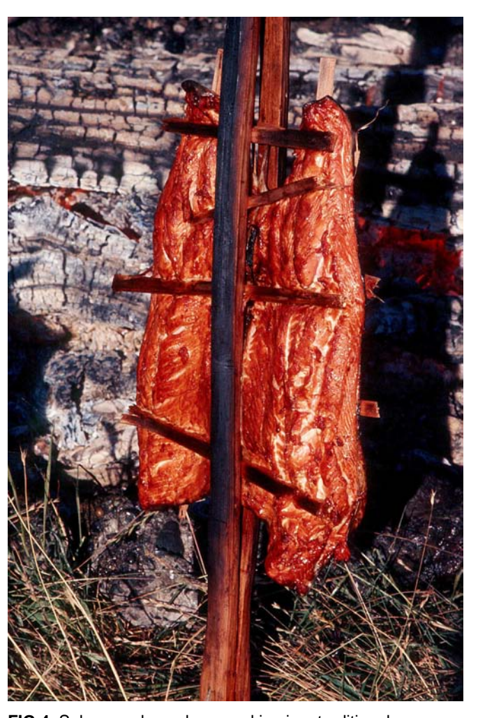
FIG 4. Salmon—shown here cooking in a traditional method—have been a mainstay of the subsistence culture in Southeast for millennia. (John Schoen)

The special importance of deer, salmon, and halibut to rural communities and Native people is a consistent theme throughout Southeast (Fig 3, 4, 5). However, a large number of other species, some not so widely distributed, are also important. Moose (Alces alces) are hunted on the mainland, particularly in the large valleys carved by transboundary rivers such as the Taku and the Stikine. In the spring, eulachon (Thaleichtys pacificus) smelt, also called hooligan, swim up these large mainland rivers by the millions. Hooligan and their oil are prized foods in many Native families and villages. The towering cliffs and ridges alongside these great river valleys are habitat for mountain goats (Oreamnos americanus), whose fur is the source of fiber for the beautiful Chilkat and Ravens Tail blankets for which Tlingit weavers are famous.