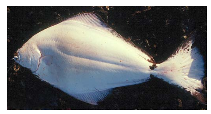
FIG 5. Halibut is a traditional subsistence food of Southeast residents.

Black bears ( Ursus americanus ) and brown bears ( U. arctos ) are abundant in Southeast, with an unusual distribution. Both species inhabit the mainland forests, but they are segregated on the islands. Brown bears are found on Admiralty, Baranof, Chichagof, and adjacent northern islands, whereas black bears are found on the southern islands. Although the brown bear is hunted by sportsmen as a trophy animal, most subsistence hunting of bear for food focuses on the smaller black bear.