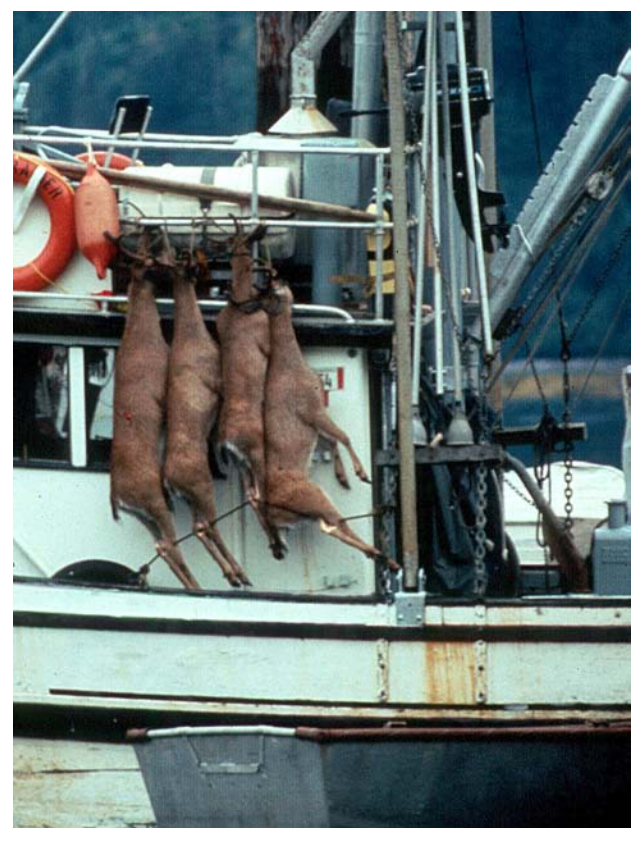
FIG 3. Black-tailed deer are the most abundant big game species in Southeast and one of the most important resources for subsistence hunters in the region. (J. Schoen)

Subsistence fishing for halibut has a long history in Southeast, as evidenced by the carved halibut hooks used by Native people for centuries. In 2003, a formal subsistence halibut fishery was authorized by the federal government, and an estimated 3,000 Southeast subsistence fishermen landed approximately 628,000 lb (285,455 kg) of halibut (ADF&G 2004).