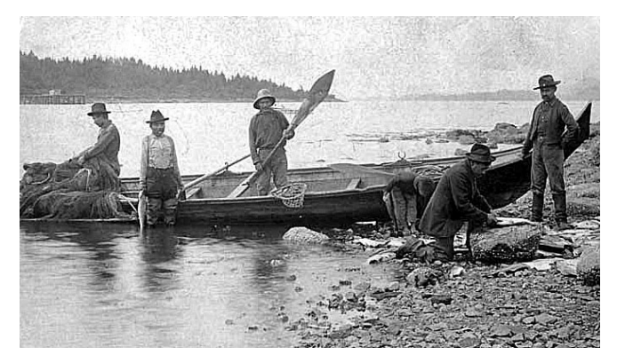
FIG 2. Tlingit shore seining for salmon near Sitka, Alaska.

The ADF&G (1990a) explained, "Subsistence hunting, fishing and gathering are not solitary pursuits. Subsistence involves structured and predictable cooperation in the production, distribution, and exchange of wild foods. Most households in rural Alaska receive wild foods from a traditional network. Some—like the elderly—receive most of their wild foods from shared production."