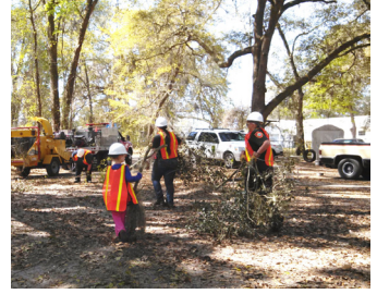
Community members take part in a Firewise clean-up day in the town of Taylor

Florida Division of Emergency Management Greater Okefenokee Association of Landowners North Florida Prescribed Fire Council Northeast Florida Chapter American Red Cross The Longleaf Alliance U.S. Fish & Wildlife Service USDA Forest Service