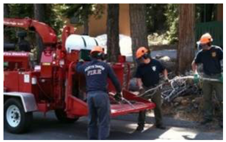
The North Lake Tahoe Fire Protection District uses its work days to build community relationships while getting fuel treatments done.

The Chestatee/Chattahoochee RC&D Council has discovered this in their work in Towns County. The Georgia Forestry Commission has a masticator that is shared among communities in the northern part of the state. The shared equipment is used to complete fuels treatments around communities at low cost. While this is certainly a great asset, the Council has learned that it is important to remain flexible with implementation timelines when using shared equipment.