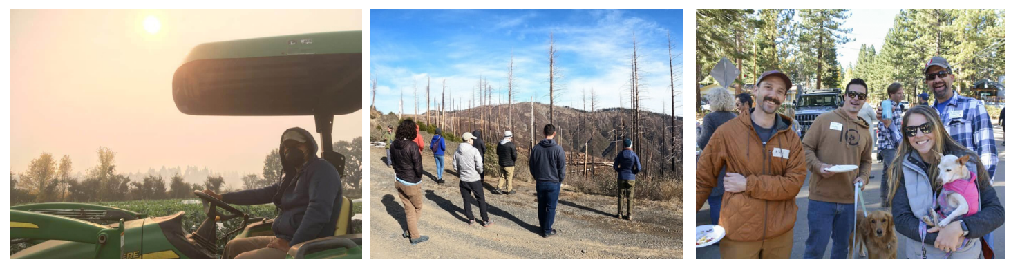
Click on photos to see the blog posts (from left): "Farming Through Wildfire Season: The Key Role of Farmers in Building Wildfire Resilience," "Ground Truth: The Limits of Scale" and "Common Ground, Neighborhood Networks, and How Preparing for Wildfire Brings Us Together."