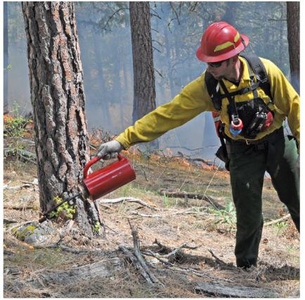
SPER project in Ashland (OR) watershed

Key to the success of the training is the integration of professional wildland firefighters into a diverse group of participants. Basic NWCG courses were offered to 15 students to provide the certification needed to allow this. Involving numerous less-traditional practitioners in the prescribed fire training expands the capacity of the fire community, as well its ability to conduct fires effectively and with full social license. The range of partners served includes university students, biologists, ranchers and farmers, municipal firefighters, volunteer fire departments, sheriff's deputies, conservationists and private fire contractors as well as managers and practitioners from county, state and federal land management agencies.