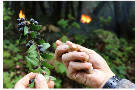
Culturally important resources like food and basketmaking materials rely on "good fire," which people are reclaiming through TREX in northern California.

http://www.conservationgateway.org/fln http://FireAdaptedNetwork.org http://nature.ly/trainingexchanges