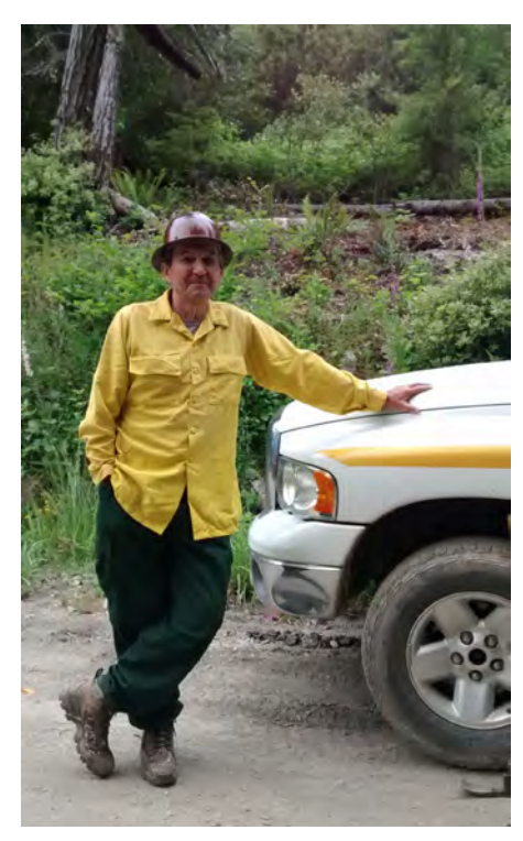
The Executive Director of Cultural Fire Management Council looks on approvingly at the spring TREX. In addition to 24 local participants, as many as 35 personnel from CAL FIRE took part in some of the burns, strengthening relationships among fire practitioners in the region.

leaders and firefighting professionals about both traditional and mainstream fire practices. This prepares them for jobs in fire management as well as for cultural survival.