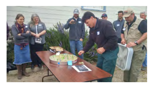
The use of sand table exercises to vividly engage residents in wildfire awareness and preparation is spreading like—well, wildfire—through the networks.