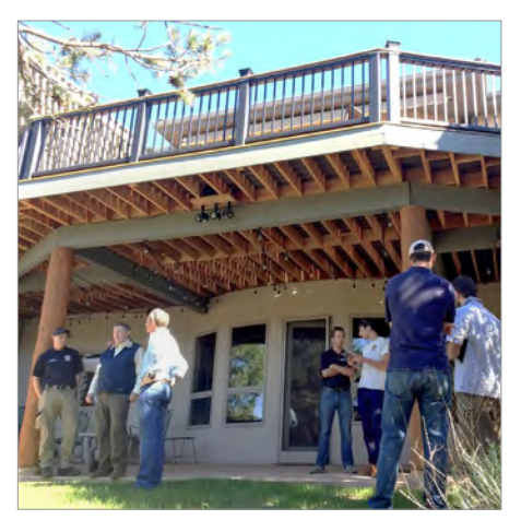
Participants in the Fire Adapted Colorado (FACO) learning exchange discuss potential issues with decks, as part of the larger conversations about assessing hazards and planning mitigation efforts.

Part of the rationale for starting FAC Net was that a network would help demonstrate a wide range of fire adaptation techniques and contexts, providing others with examples of what's possible. That premise has proven true—and one of the most beneficial things the FAC Net does is