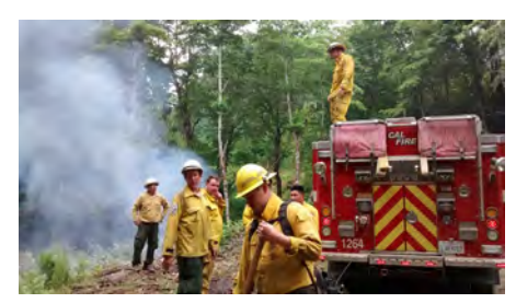
The Yurok TREX provided training for 24 local participants, who completed strategic burns for community safety and cultural resources. They also had a chance to work side-by-side with 35 CAL FIRE firefighters, an important relationship-building opportunity for the community.