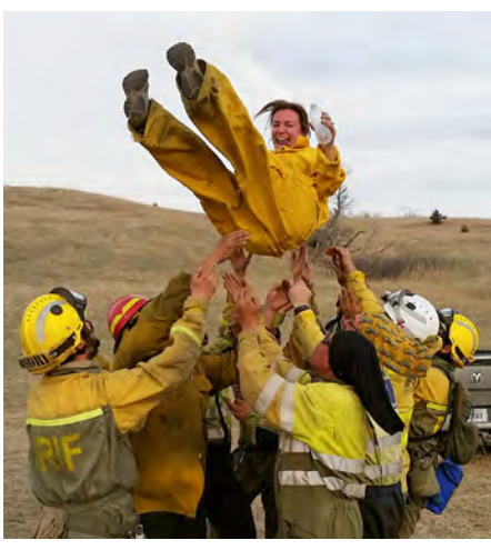
Delighted, engaged landowners—like this first-time burner at the Loup River TREX this spring—are a sign of TREX success.

In fact, the growth of the TREX strategy is already well under way. This spring saw eight TREX and cooperative burns—up from five last spring—in Nebraska, Iowa, Oregon, New Mexico and California. All told, 318 people gained valuable experience, while conducting 14,437 acres of burning for forest and grassland health, watershed resiliency, community protection and management of cultural resources. Planning for the fall season was also active, with eight TREX currently on the schedule.