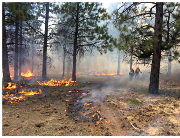
Above: A Chama TREX crew uses a dot ignition pattern on a burn on the San Juan NF in southwest Colorado.

Left: An Ashland TREX crew provides structure protection while burning around homes on a tract of private land in Applegate Valley.