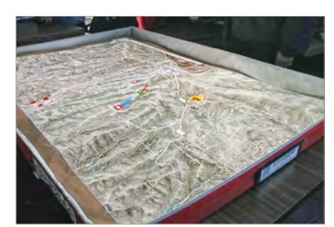
A community workshop in Island Park (ID) used a Simtable—a sand table with maps and other data projected onto it—to powerfully expore community risk.

In Minnesota, members in Ely used experience and insights from the network to support the development of a strategic communications plan. They also modeled their "Living with Fire" event, co-hosted by the state DNR, on curriculum from Oregon FAC Net members.