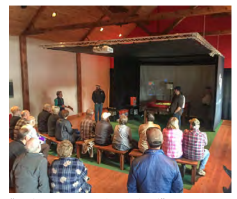
"My home was just burned up!"

And the conversations rolled on from there at the Island Park sand table wildfire simulation. Although few Island Park residents might be expected to be thinking about wildfire in April—like most Idahoans, they are usually focused on snow melting and greening grass—about 40 took part in this eye-opening workshop.