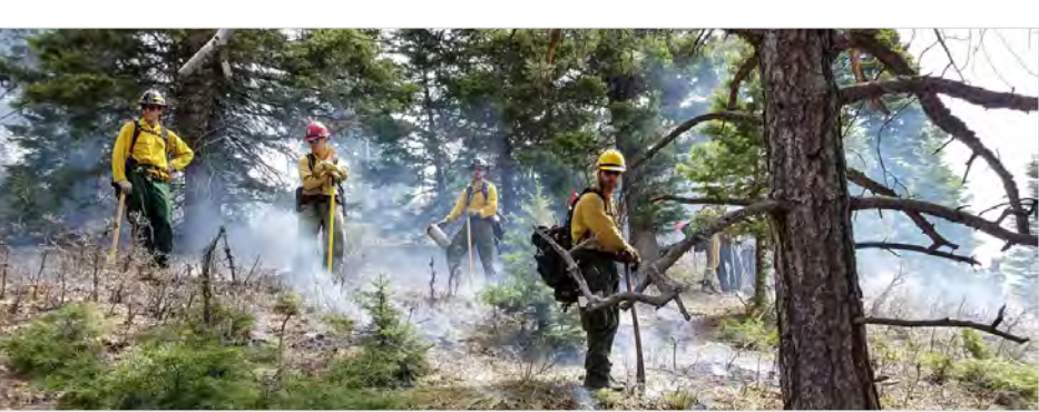
Rancho Lobo broadcast burn during the spring 2017 Chama TREX

The TIFMP completed essentially all its SPER work by the end of 2016, then put the finishing touches on the last piece—the Garden Gulch burn plan early this year. This plan will leverage SPER work to a larger scale, as it has become the foundation of the Weaver Basin Community Protection burn plan. This plan covers about 1,600 acres spanning multiple landownerships, and —because of agreements and relationships seeded through SPER—will result in "all lands" burning conducted by multiple partners, including the Watershed Research and Training Center, USFS, Firestorm, local VFDs, Trinity County RCD and CAL FIRE. Some of the areas covered by the plan may be burned as early as this fall, possibly as part of the NorCal TREX.