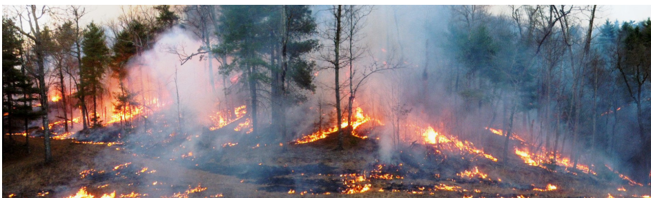
Ryan Jacobs/NC WRC

More about the landscape: http://www.nature.org/ourinitiatives/regions/northamerica/unitedstates/northcarolina/placesweprotect/south-mountains-game-land.xml