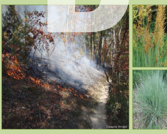
The application of prescribed fire (above) is well planned and performed to enhance native plant species, such as Indian grass (top right) and little bluestem (bottom right).

After a significant period suppressing fires, controlled burning is now recognized as a valuable tool. It removes layers of dead grass, leaf litter, and duff that inhibit the germination and growth of native grasses, wildflowers and trees. Controlled burns can thin crowded forests, resulting in less severe disease and insect pest outbreaks.