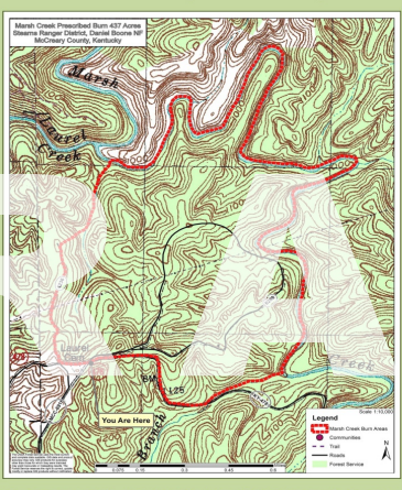
The area north of County Road 478 (shown in red above) is burned every 1 to 3 years. Mowing is performed yearly, often in strips, to provide varied habitat for animals and plants. A walk along road 6280 (the loop into the interior) will take you through spacious stands of timber and grassy areas that offer forage and protection available for wildlife.

Marsh Creek Pine Savanna is dominated by pine trees, grasses, and wildflowers. This valuable habitat is being maintained using controlled burning, in addition to mechanical thinning, and mowing.