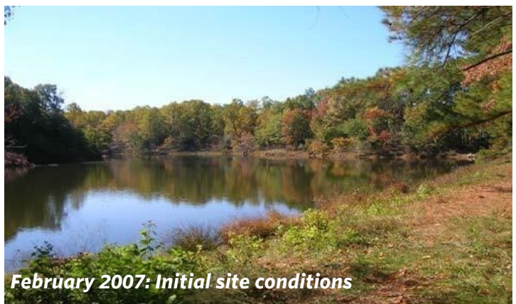
February 2007: Initial site conditions