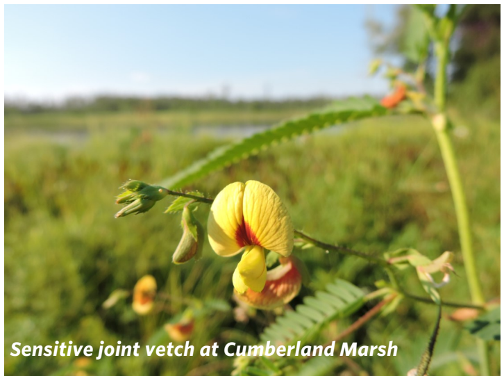
Sensitive joint vetch at Cumberland Marsh