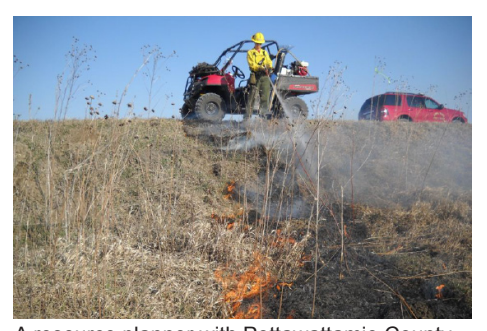
A resource planner with Pottawattamie County makes sure the fire stays where it belongs.