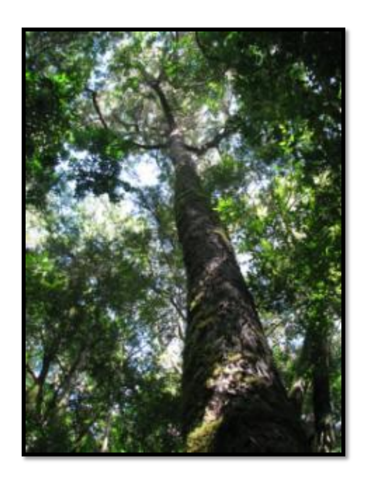
Mathews Forest Range Ecological Assessment Summary Report Namunyak Wildlife Conservancy Samburu, Kenya June 2010