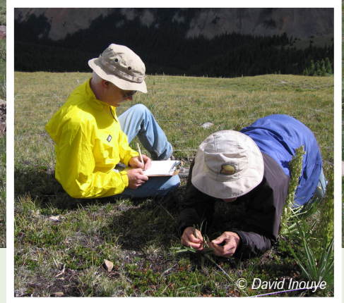
Rocky Mountain Biological Laboratory scientists conducting long-term research contributing to our understanding of climate change effects on species and ecosystems.

Climate change is already affecting ecosystems in the southwestern U.S. in ways we can see and measure. Warmer temperatures and episodic drought have contributed to changes in native plant and animal populations and habitats.