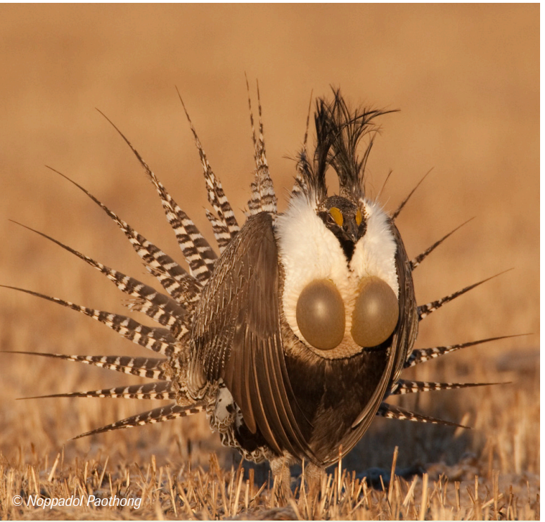
(Map): The Gunnison Climate Working Group is developing strategies to address climate change issues across jurisdictional boundaries in the Upper Gunnison Basin. (Gunnison Sage-grouse): The group is developing a landscape scale model for enhancing the resilience of wetland/riparian habitats important for sage-grouse brood rearing and summer/fall survival.