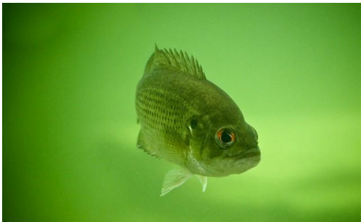
Rock bass

New York: Confined river, Unconfined river, Backwater slough. Pennsylvania: Atlantic Basin Fish Warmwater Community 2, Ohio-Great Lakes Basins Fish Warmwater Stream Community