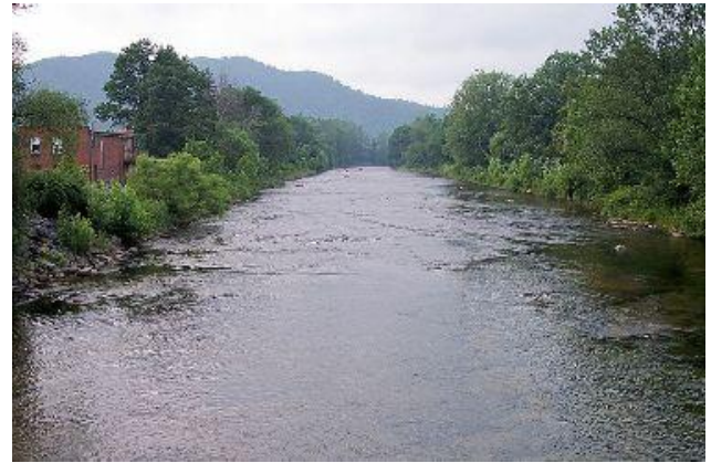
Shavers Fork