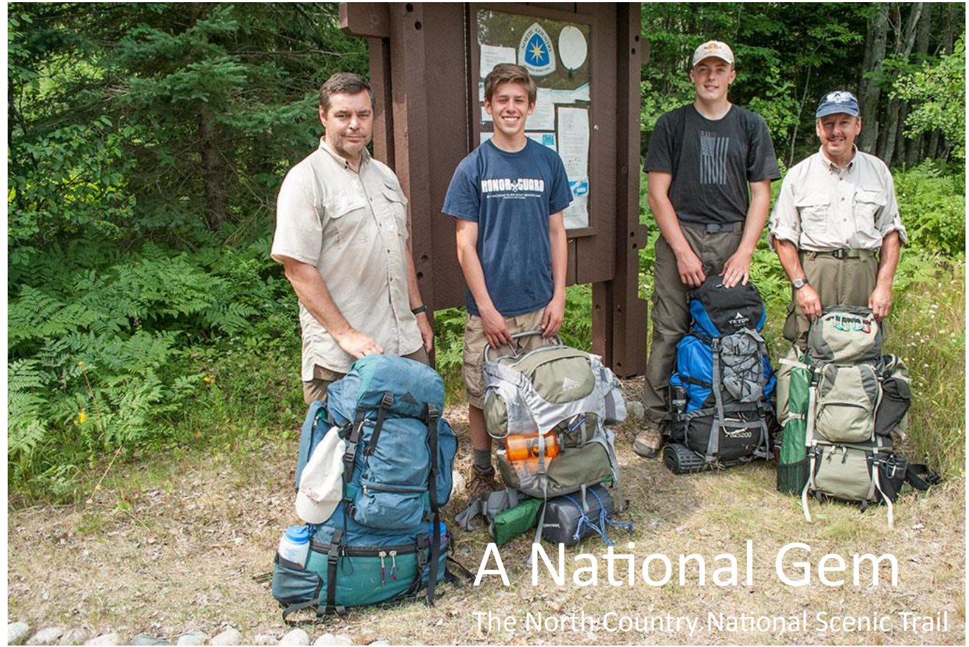
Boy Scouts at Grand Marais Kiosk.

Grand Marais, Michigan - The North Country National Scenic Trail is America's longest National Scenic Trail, stretching 4,600 miles from New York to North Dakota. More commonly called the North Country Trail or NCT, it began as a proposal in the mid-1960s and became a reality in 1980. Its designation as a scenic trail means visitors experience some of the most outstanding beauty found