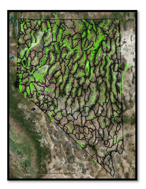
Figure 2. Areal extent of potential groundwater discharge boundaries and ET units (green) that were originally delineated during previous U.S. Geological Survey studies and modified by the Desert Research Institute.

Figure 1. Hydrographic areas (yellow) containing potential groundwater discharge boundaries and evapotranspiration units.