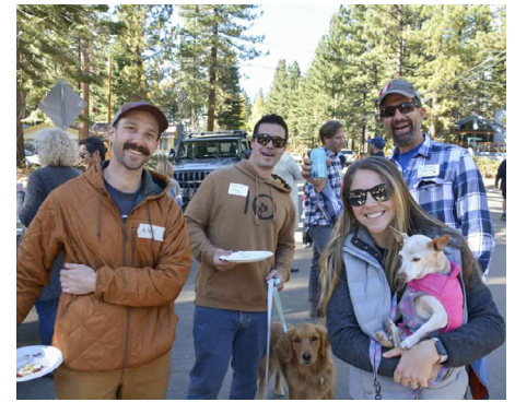
Click on photos to see the blog posts (from left): “Farming Through Wildfire Season: The Key Role of Farmers in Building Wildfire Resilience,” “Ground Truth: The Limits of Scale” and “Common Ground, Neighborhood Networks, and How Preparing for Wildfire Brings Us Together.”