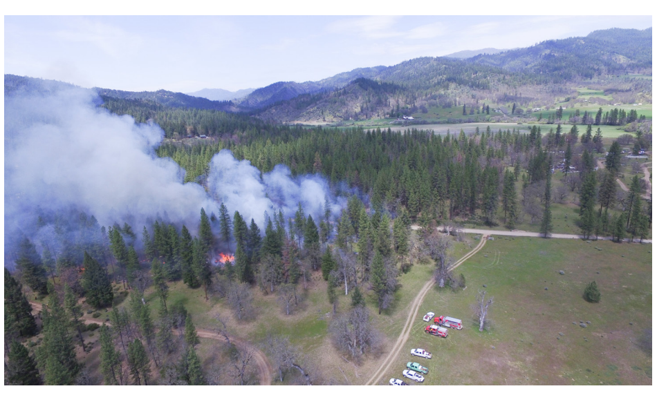
The FLN led spring burning near Hayfork, California, building capacity and partnerships.

In the Southeast, the South Central FLN continued its multi-state work with the Shortleaf Pine Initiative, hosting a regional workshop in northwest Alabama in January. More than 20 partners from Alabama, Arkansas and Tennessee convened to help initiate a 22,000-acre shortleaf pine restoration and demonstration area in a two-state landscape involving multiple partners who have rarely worked together precisely the kind of work the FLN excels in. Project partners toured the restoration area, discussed current conditions, and began the development of desired future conditions for different sites. Partners also discussed current challenges, restoration prescriptions, and, perhaps most important, opportunities to accelerate the partnership.