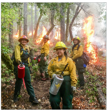
Ignition Squad on the Pierson Unit for the 2016 Klamath River TREX. In communities along the Klamath River in northwest California, local tribes are partnering with non-profit organizations to re-invigorate cultural fire management. Diverse cultural perspectives, and institutional and organizational representation enriches their fire management approach.

This fall, while others in the PERFACT partnership led the Women in Fire TREX, which focused on women in fire leadership, FAC Net members took on other areas of diversity. For example, a workshop in Austin focused on getting non-traditional personnel into Resource Advisor roles. In New Mexico, the Wildfire Network is a new organization aimed at providing job training in wildfire mitigation and management for disadvantaged youth, thus addressing two community needs simultaneously.