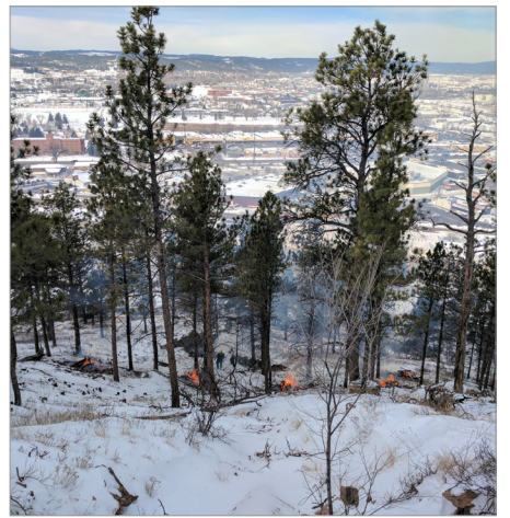
Prescribed burning on a municipal property in the center of Rapid City, SD.