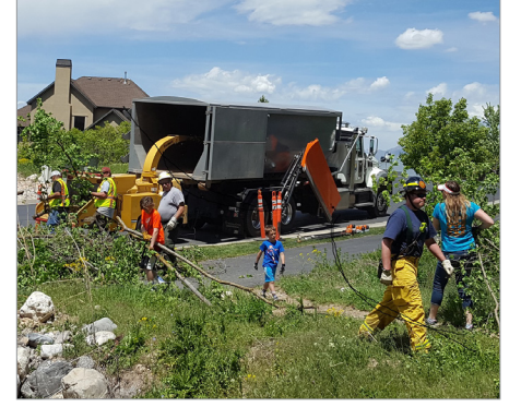
In North Salt Lake, an Eagle Scout implemented a wildfire risk reduction project with help from local residents and staff from South Davis Metro Fire; Utah Division of Forestry, Fire and State Lands and the city's open space program.

"Recent news coverage of a large prescribed burn in the area has started to shift language in the community to focus on positive descriptors like "good fire" and "fire resiliency in our forest." Help from the resources that our FAC Net staff liaison provided made this effort easier by giving us good ideas about the points to focus our efforts on and how to most effectively promote the message we want to convey."