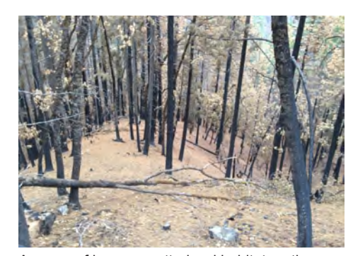
An area of known spotted owl habitat on the Klamath National Forest burned in the summer fires. The scorched conifer needles and oak leaves will fall during the winter rains.