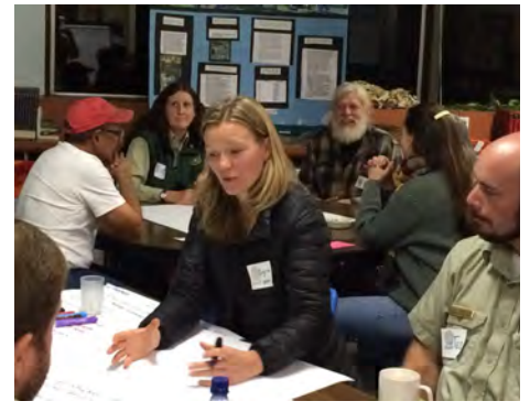
The Klamath National Forest supervisor and a district ranger exchange ideas with residents of Sawyers Bar and staff from the Salmon River Restoration Council.