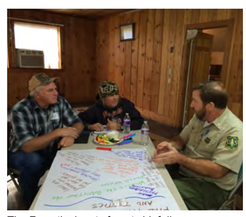
The Forest's deputy forest chief discusses firefighting strategy with a local business owner and a local river guide at the meeting in Happy Camp.