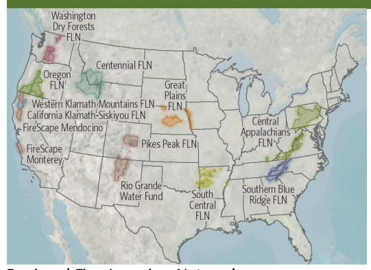
Regional Fire Learning Networks