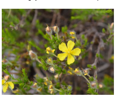
Mountain golden heat her ( Hudsonia mo ntana ) is a rare endemic, fire-dependent plant found only in the Central Blue Ridge Escarpment Landscape.