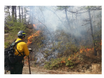
A collaborative approach to restoration with fire has been highly successful in this landscape.