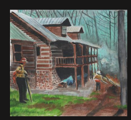
Burning to reduce fuel and conduct outreach in fire adapted communities in the Blue Ridge.

The Southern Blue Ridge Mountains FLN includes the Georgia Blue Ridge Mountains landscape in Northeast Georgia. Rugged ridges and rounded peaks range in elevation from 1600 – 4700 feet. About 80% of the area contain pine-oak forests that rely on fire to maintain healthy structure and function. Partners are proud to be involved in the Fire Adapted Communities Learning Network (FAC.Net). Outreach has led to increased knowledge about the benefits of fire management and has heightened awareness of wildfire safety and risk.