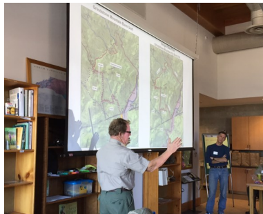
Successful implementation of complex, multi-stakeholder, cross-boundary burns requires much planning and communication among partners.