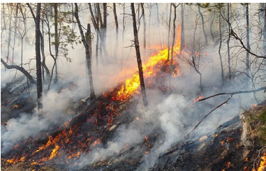
Collaborative efforts resulted in implementation of six burns at both high and low elevations totaling 700 acres.