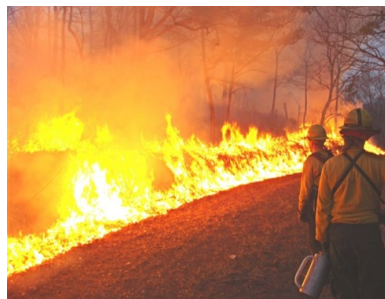
Restoring fire to the South Mountains protects public safety and improve ecosystem health.