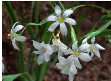
The endangered White Irisette ( Sisyrinchium dichotomum ) depends on fire and is endemic to the South Mountains area.