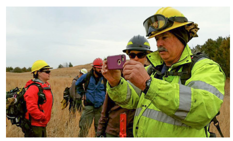
Wet weather was able to put a damper on firing activities but not crew morale. Participants took advantage of non-fire weather by setting up monitoring plots for an upcoming prescribed fire. Reducing invasion by eastern redcedar is a primary objective of the Niobrara TREX. Small redcedar trees occur throughout the grasslands and in the bur oak leaf litter understory. Niobrara TREX participants created photopoints and marked redcedar trees to document mortality rates from the planned prescribed fire.