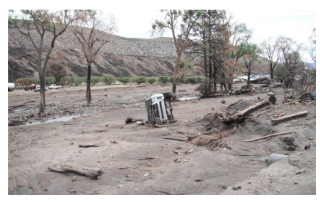
Flooding and debris flows followed the 2011 Las Conchas fire in New Mexico.