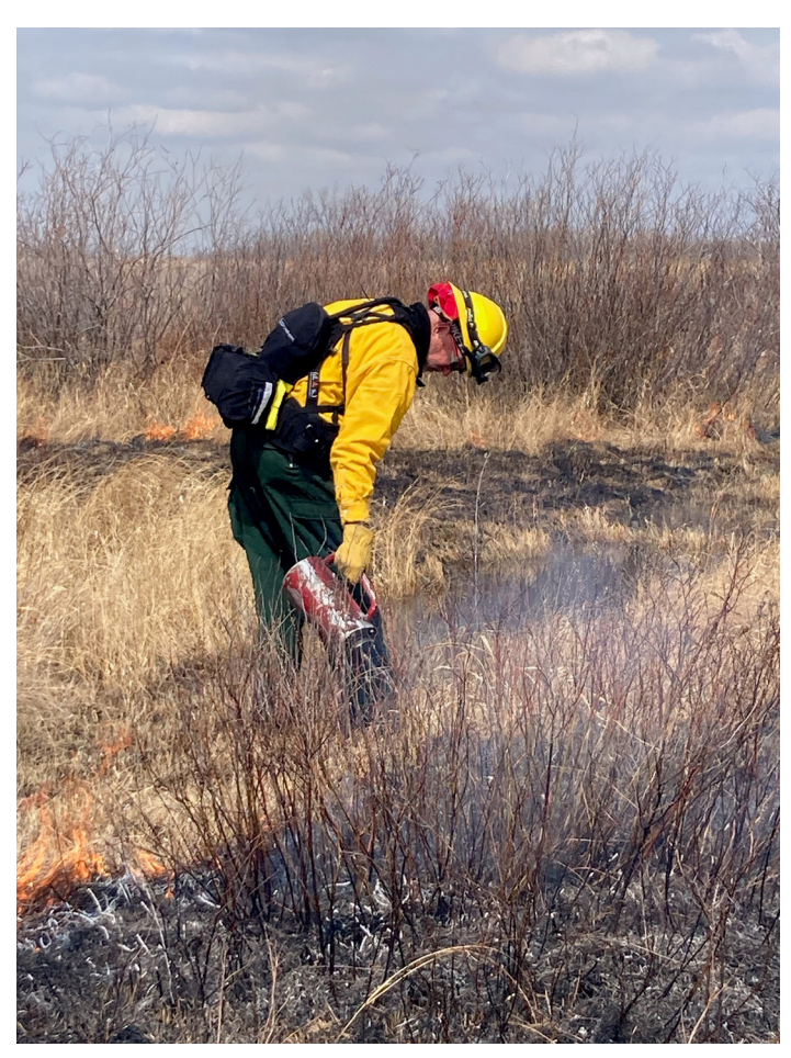
At "The Grids" research plots at Pembina Trail Preserve, dk lays down blackline with a drip torch in preparation for burning the 10x10 meter plot.

And then we got an invitation to burn with TNC—in North Dakota or Minnesota. We jumped on it. Hollie and I packed up, and headed north.