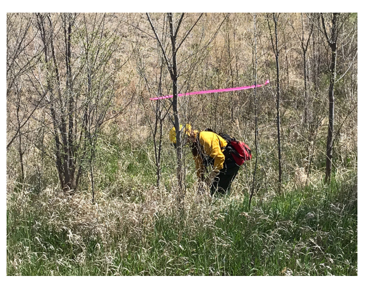
While cutting fire line at Heendah Hills Pond, Hollie applies her REAF (Resource Advisor-Fire) training by marking resources to be protected.