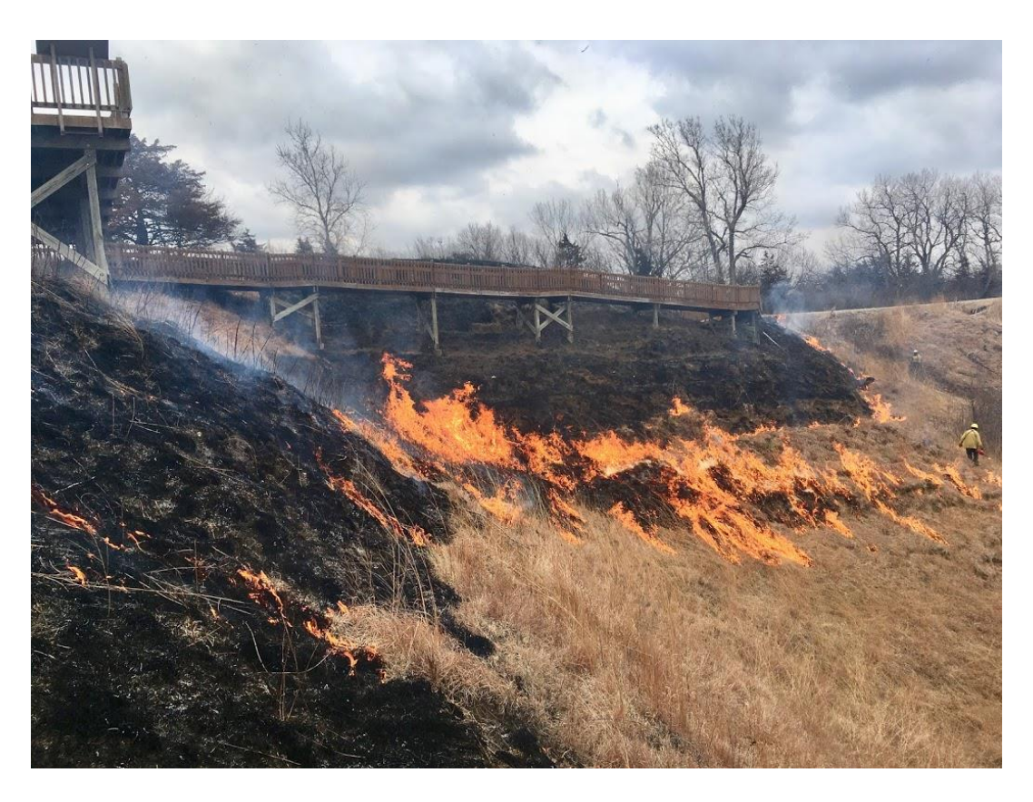
Blacklining the DNR Overlook Deck, Monday the 19^{\rm th} .