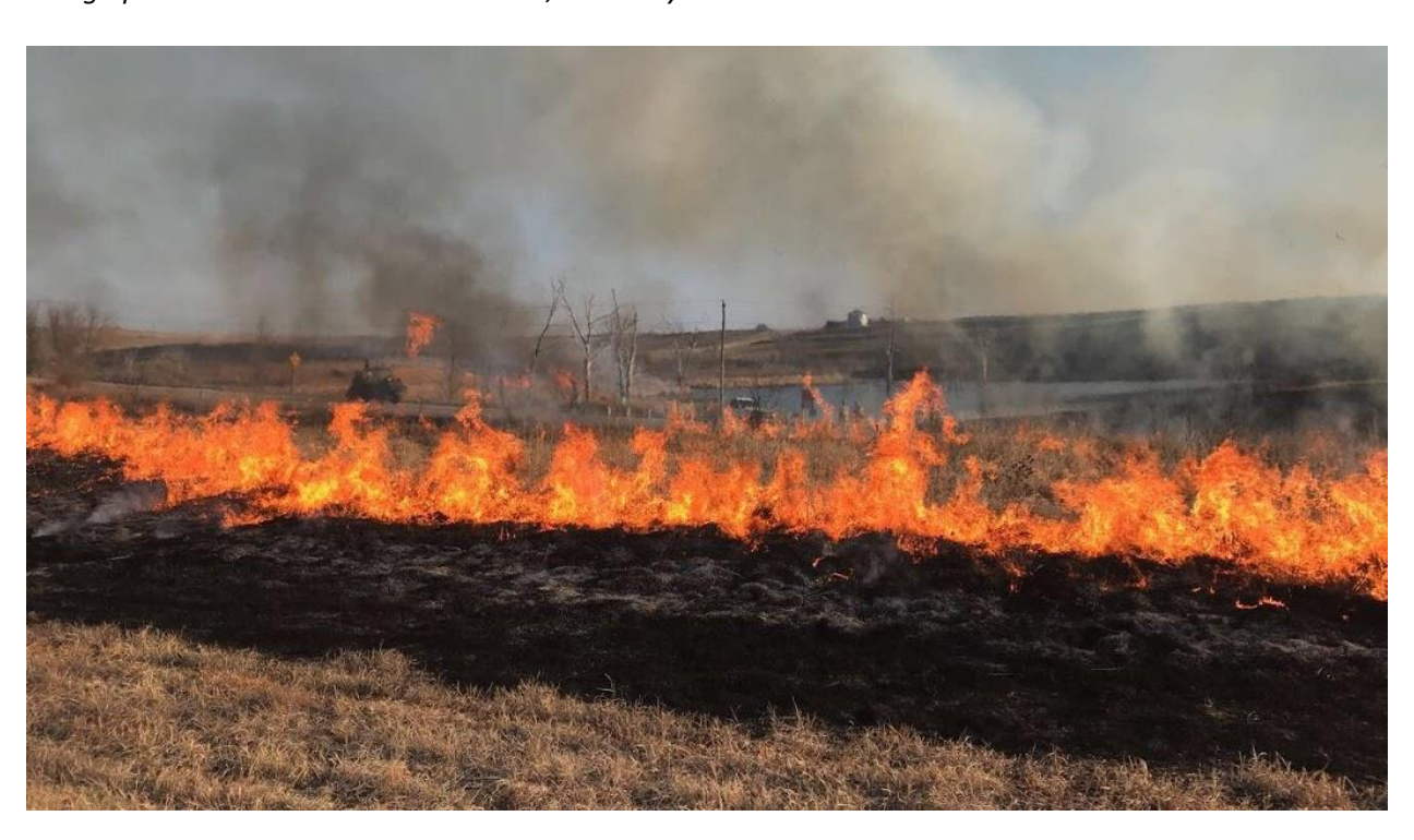
Farm Creek Public Wildlife unit, Wednesday the 21st.