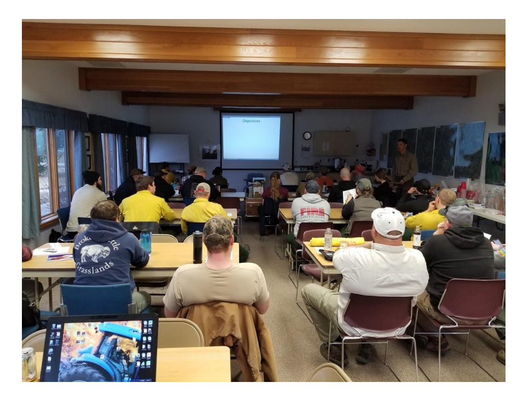
Participants in the S-211 Portable Pumps course, Monday the 19<sup>th</sup>.