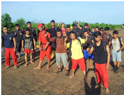
Sinarmas firefighters at Simpan Heran (Palembang, Sumatra, Indonesia) prepare to start their arduous pack test.