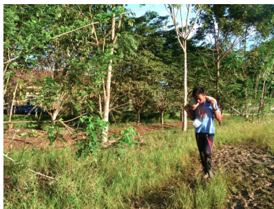
A Sinarmas firefighter completes his arduous pack test in Sungai Tapah (Jambi, Sumatra, Indonesia).