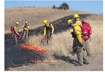
Left to right: The 2014 Klamath River TRES drew about 80 people, 17 of whom fulfilled basic NWCG firefighter requirements and received FFT2 certification on completing the TRES. The Loup River Valley TRES brought together fire practitioners from federal and Nebraska state agencies, NGOs, private contractors, municipal firefighters from several fire departments in Colorado, and practitioners from various agencies in Spain; this range of experiences in different fire management systems contributes to robust learning at TRES. A special weekend session on firing operations for VFDs was added to the 2015 Niobrara TRES to improve the local capacity to respond to wildland fires with safe and effective burnout techniques.