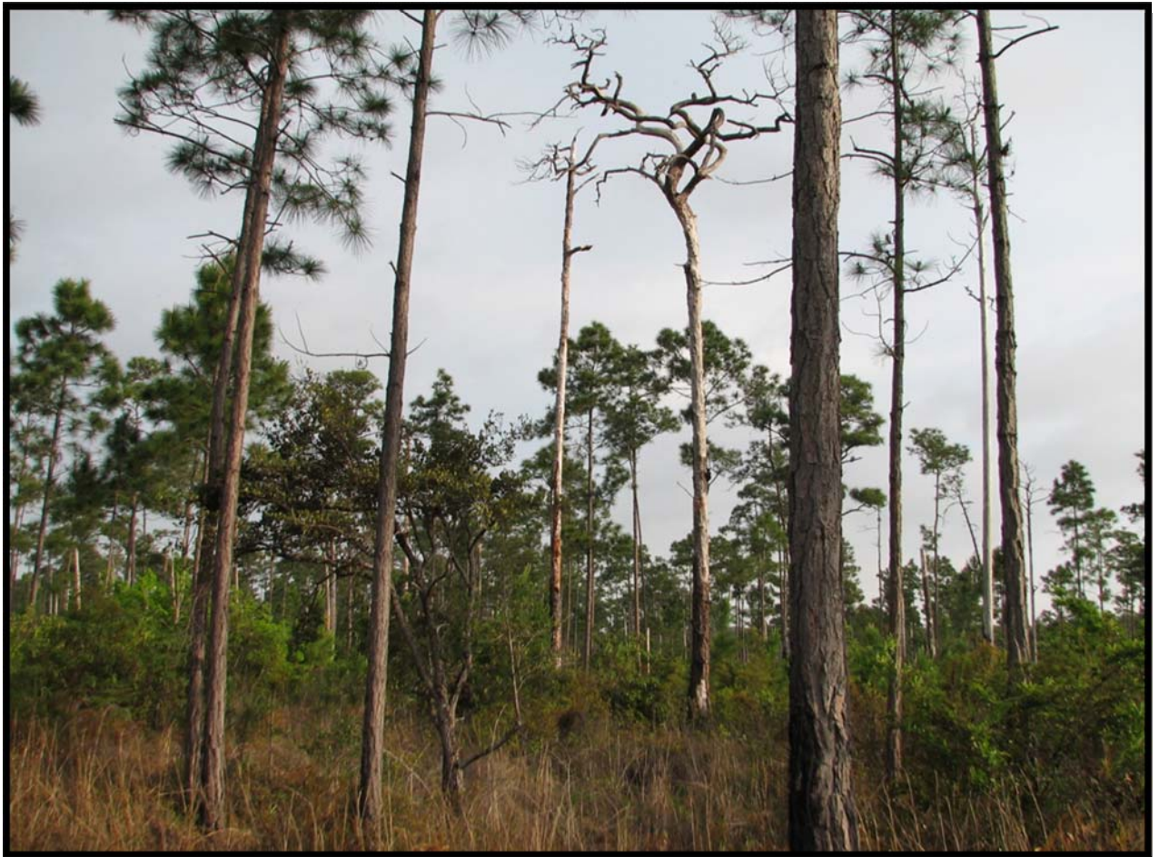
Figure 4. Open, grassy understory in a stand of old-growth Caribbean pine on South Andros.