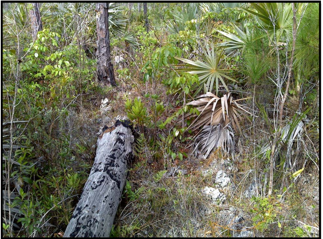
Figure 10. Downed wood, also an important habitat element for many species of wildlife, was common in the old-growth pines of South Andros.