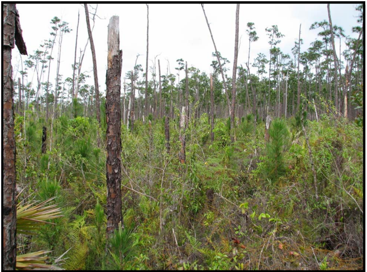
Figure 8. Standing dead trees, an important habitat element for many species of wildlife, were abundant in the old-growth pine forest but nearly absent from the second-growth pine forest.