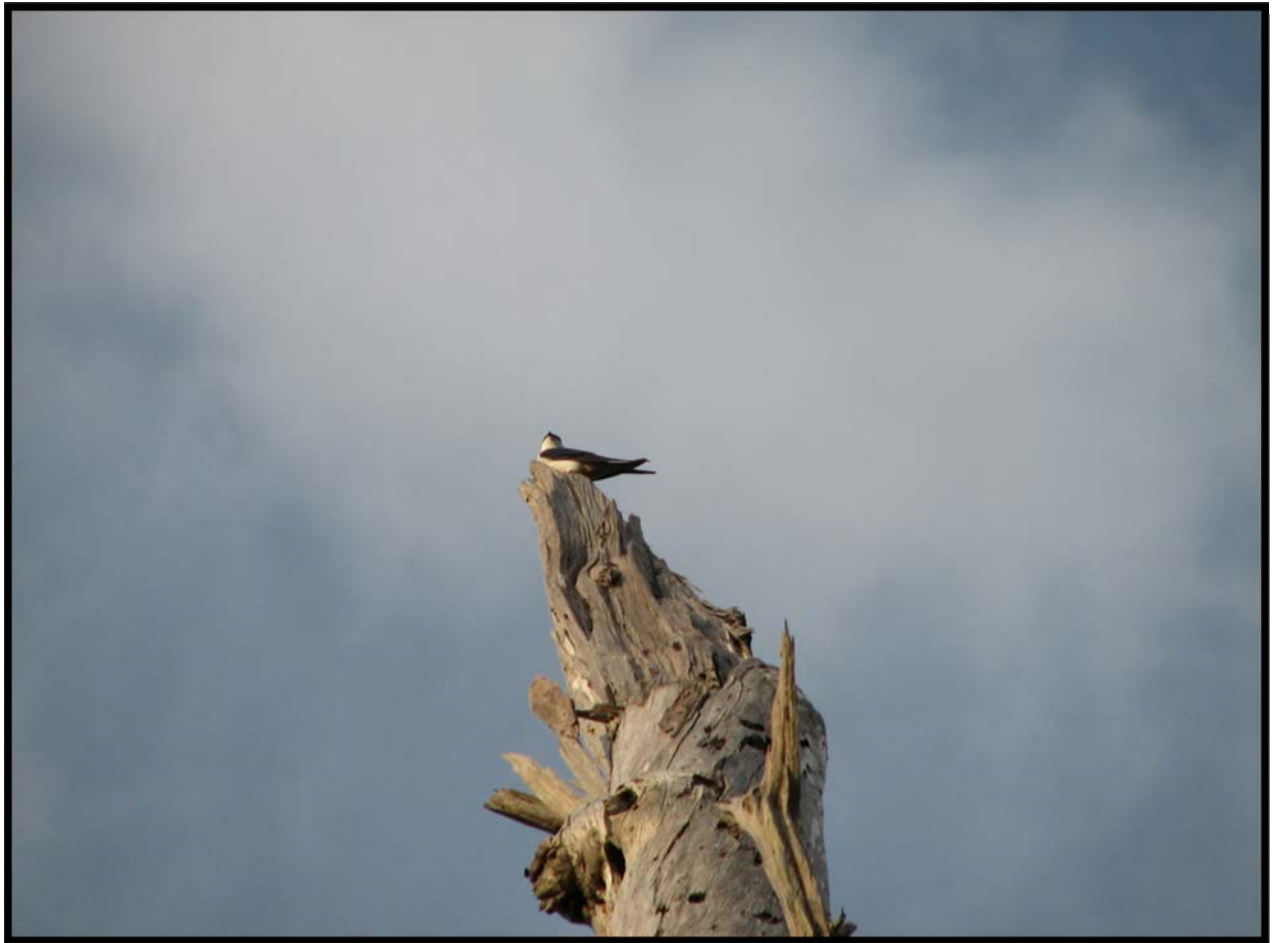
Figure 9. A Bahama Swallow perches above its nest in a standing dead tree in an old-growth pine forest on South Andros. This pineland endemic was far more abundant in old-growth pines than in second-growth pines.