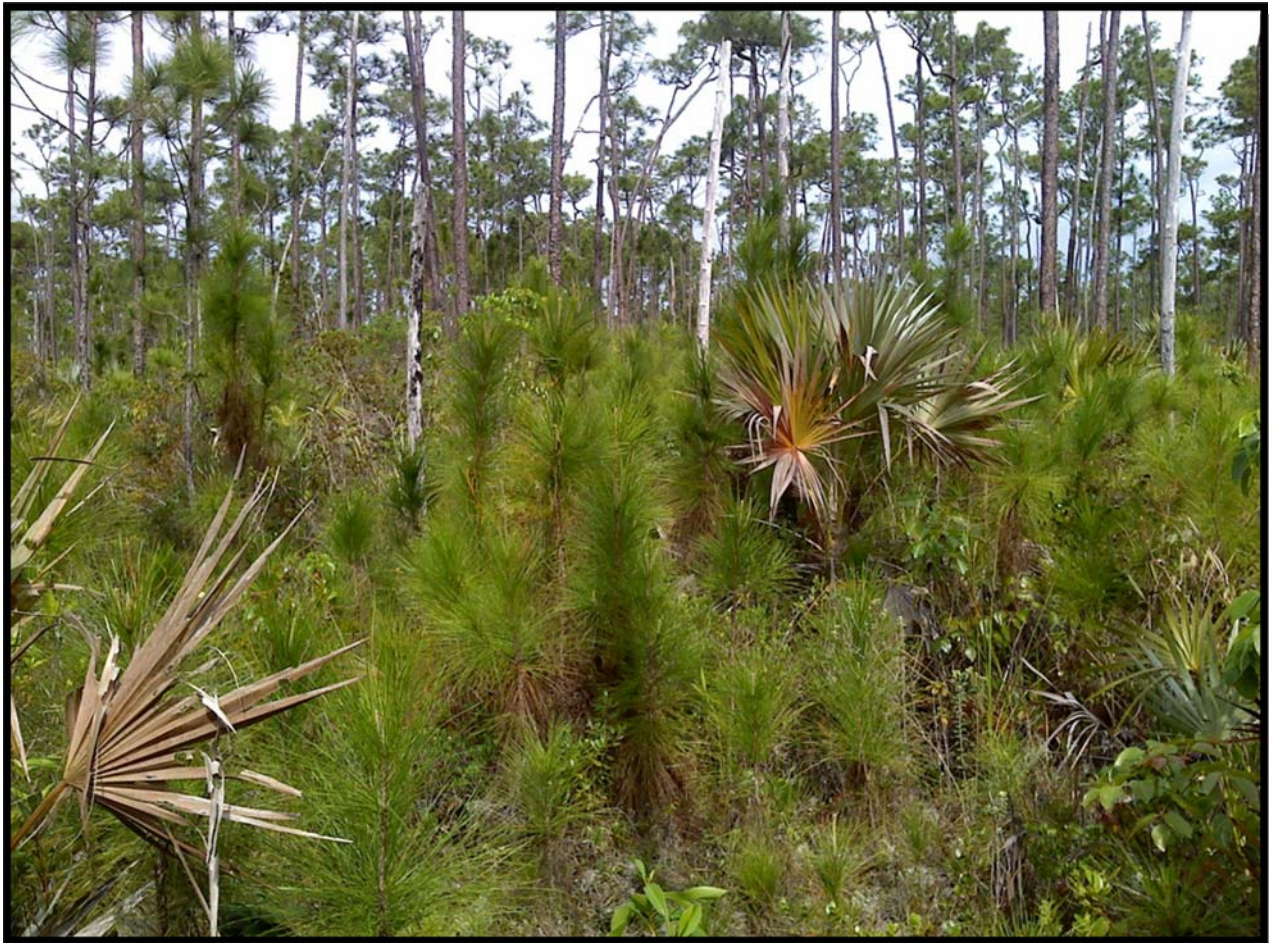
Figure 7. An old-growth stand of Caribbean pine on South Andros supported a range of age classes of pine, from young seedlings to mature individuals.