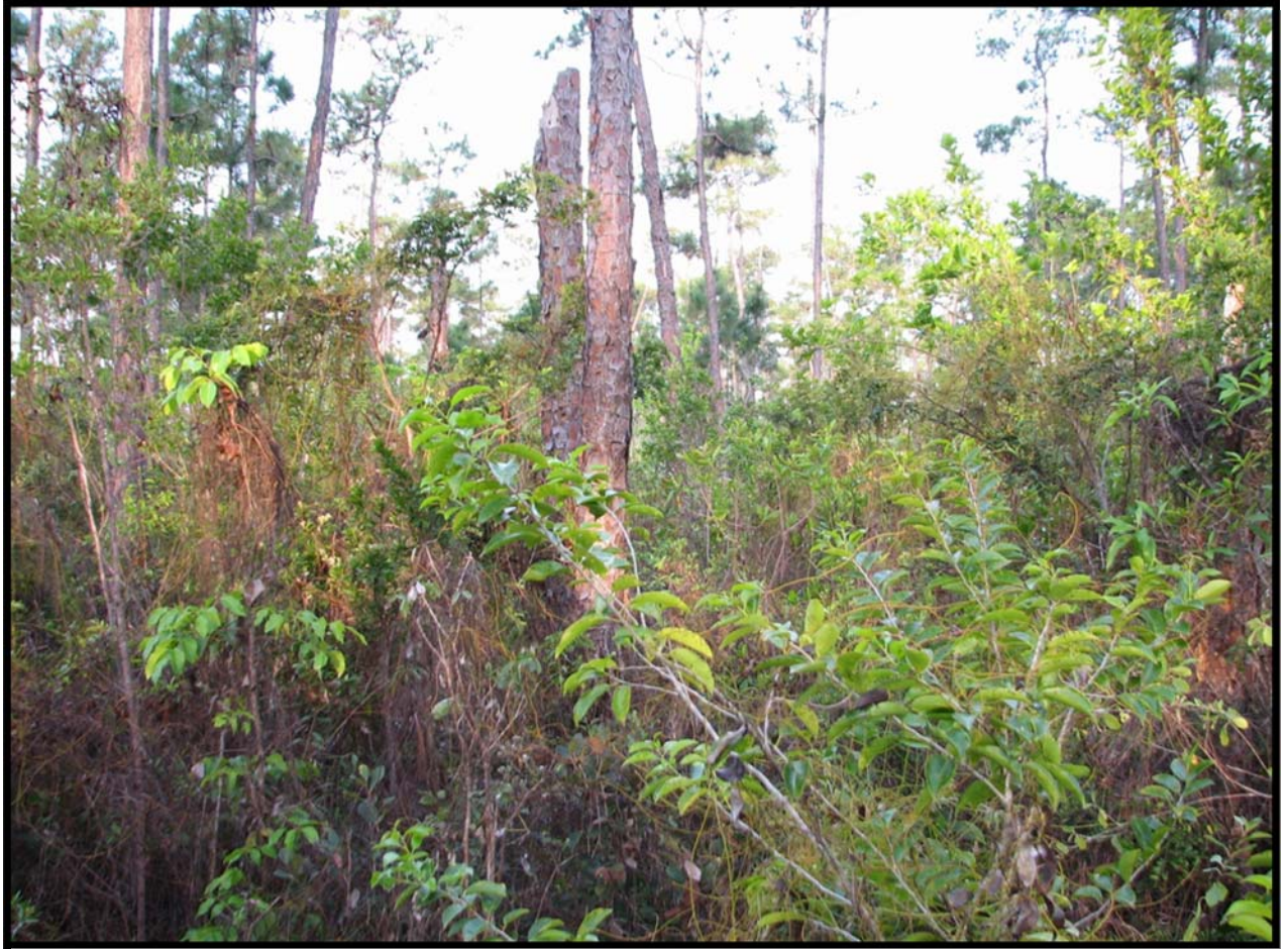
Figure 3. Dense and tall (c.a.10-12 ft) hardwoods in the understory of an old-growth Caribbean pine forest on South Andros.