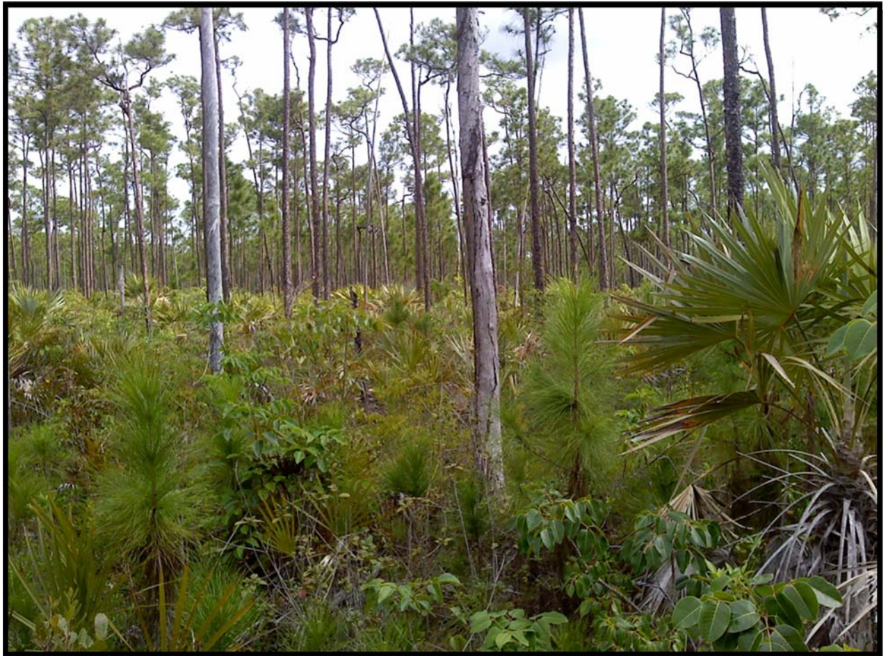
Figure 5. An extensive stand of thatch palm beneath a canopy of old-growth Caribbean pine on South Andros.