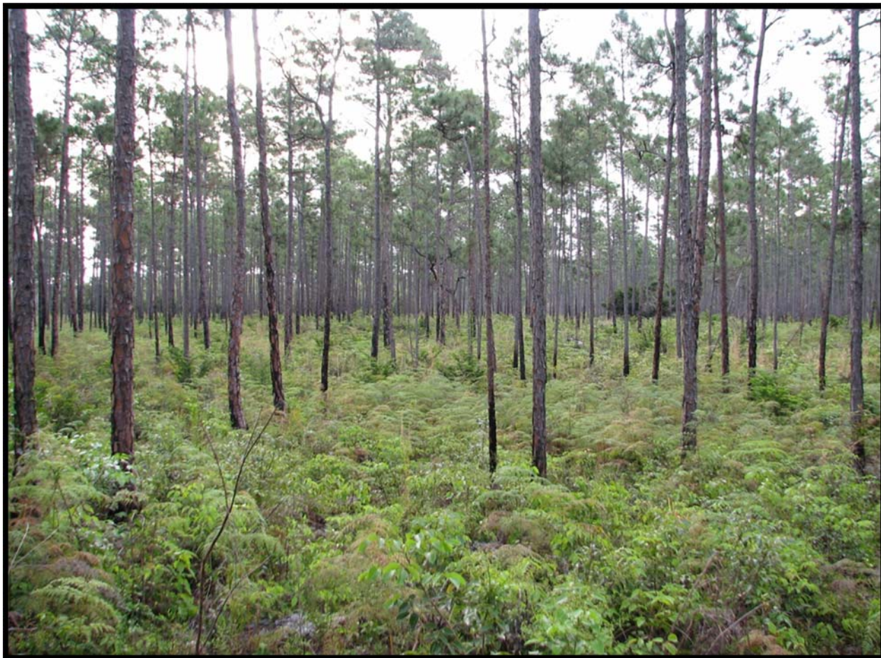
Figure 6. Previously logged pine forest on North Andros was less structurally diverse than old-growth pine forest on South Andros. Understory conditions in every stand sampled were similar to those pictured here.