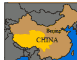
Figure 1. Qinghai Province

Named after its largest inland plateau lake, Qinghai Lake, Qinghai Province (pronounced Ching-hai) is located in China's southwestern region (Figure 1). The Province is 737,129 square kilometers, constituting one eighth of the country's total area. It is the fourth largest Province in area after Xinjiang, Tibet and Inner Mongolia Autonomous Regions.