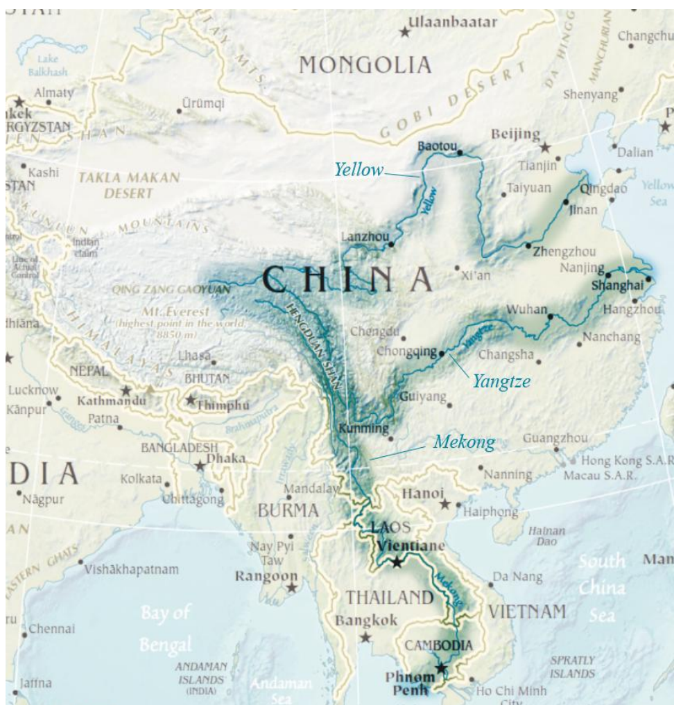
Figure 2. China map showing the Yangtze, Yellow and Mekong Rivers.