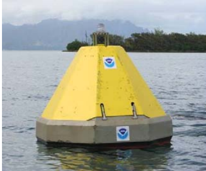
Monitoring buoy collects data on salinity, pCO_2 of air and water, temperature, and O_2 of air and water