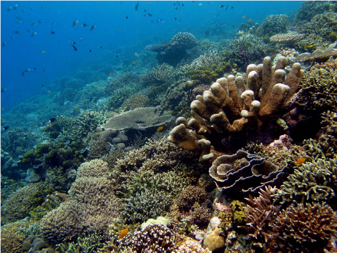
Resilient coral garden at Halmahera, Indonesia.