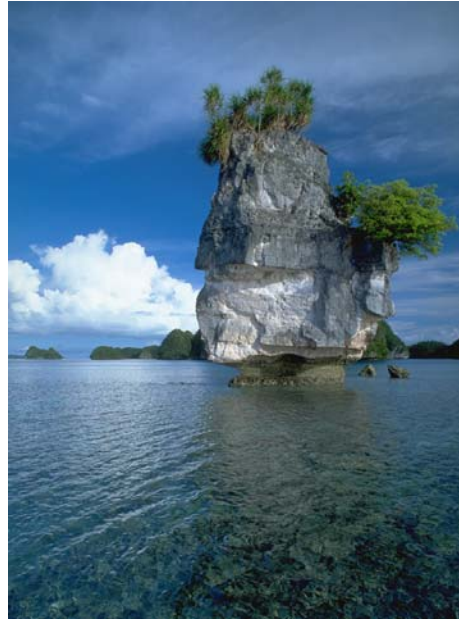
Rock Islands of Palau (limestone)