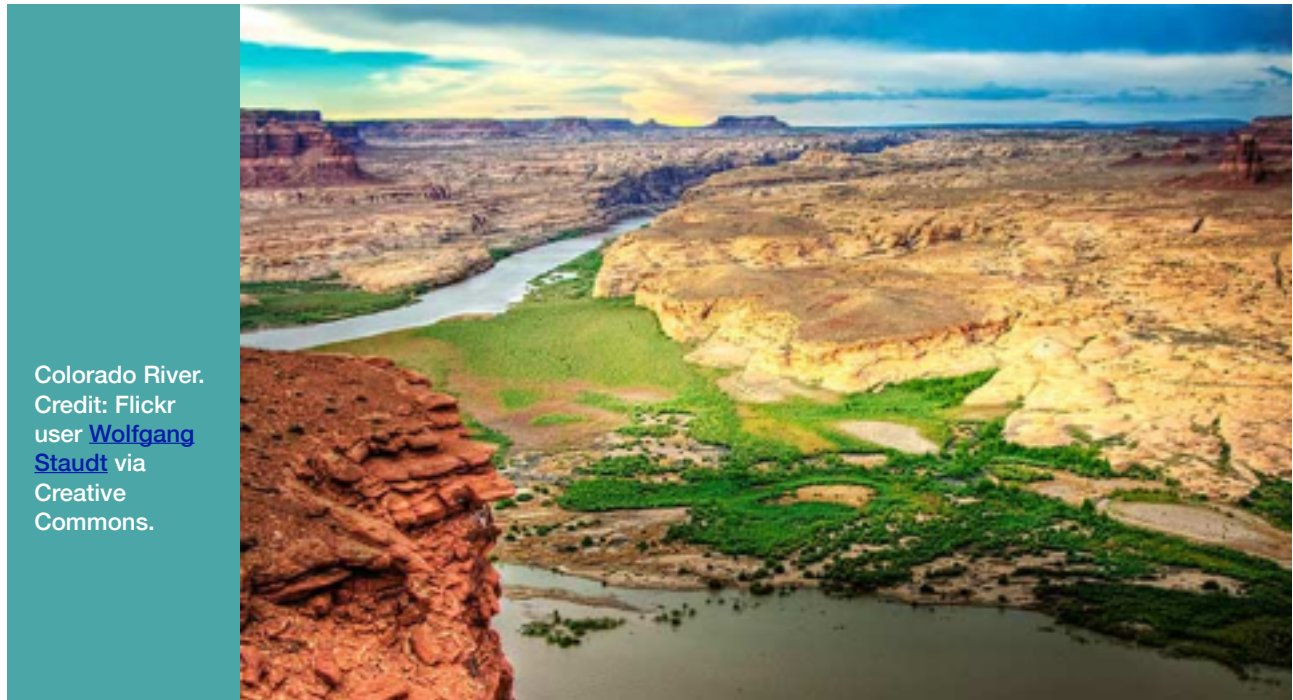
Colorado River.