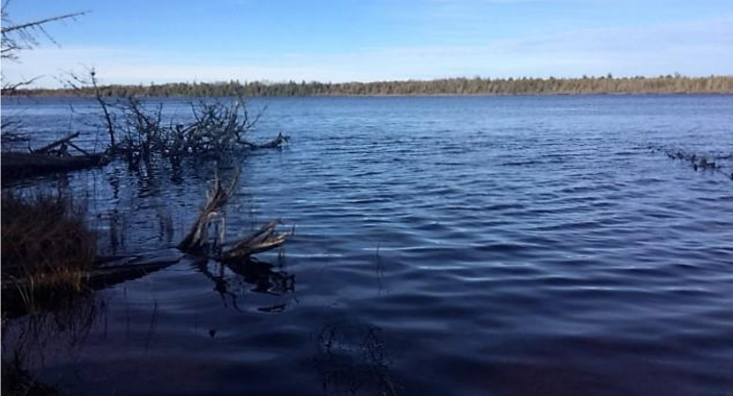
Batty Doe Lake.

Batty Doe Lake, Mackinac County - Michigan I didn't actually misplace Seiner's Point - I did the opposite of finding it. But what do you call that? Misplacing is more apt than losing, but neither word suggests the truth; I never had it at all.