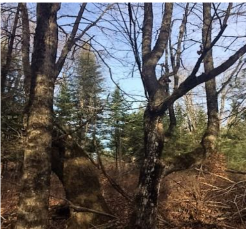
Google's Path to Seiner's Point.

But there's not a cabin in sight. I blaze a bit of trail, looking for the elusive path to Seiner's Point. Where the roads to Batty Doe Lake offered some hope of discovery, Seiner's Point seems like a dream – only muck and dense forest from where I stand.