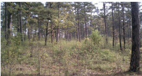
Left: Restored pine/oak woodlands in the Ozarks National Forest